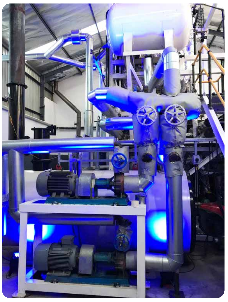
Multistage bitumen converter

Bituminous products manufactured in the converter in Cape Town are available to all asphalt manufacturers in South Africa.