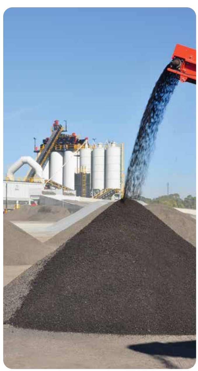
AECI Much Asphalt undertakes asphalt recyling to reduce carbon footprint and protect non-renewable resources.