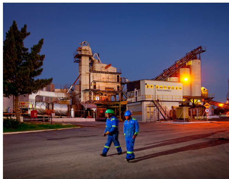
Much Asphalt Eerste River plant, Western Cape