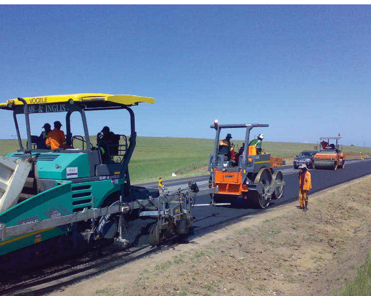
N2 Mthatha, Eastern Cape

Much Asphalt's HMA products are supplied from permanent asphalt mixing plants across South Africa, and in Namibia and Mozambique. Mobile plants supply quality products to remote projects.