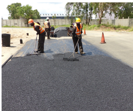
Hand asphalt training